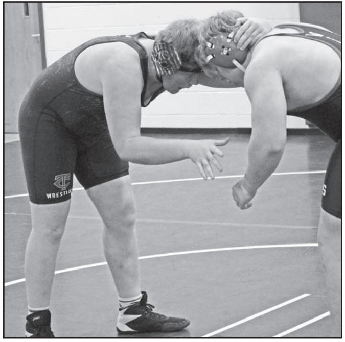
Towns County placed fourth in the team standings with 91 points, edging fifth-place Murphy, NC by 12.